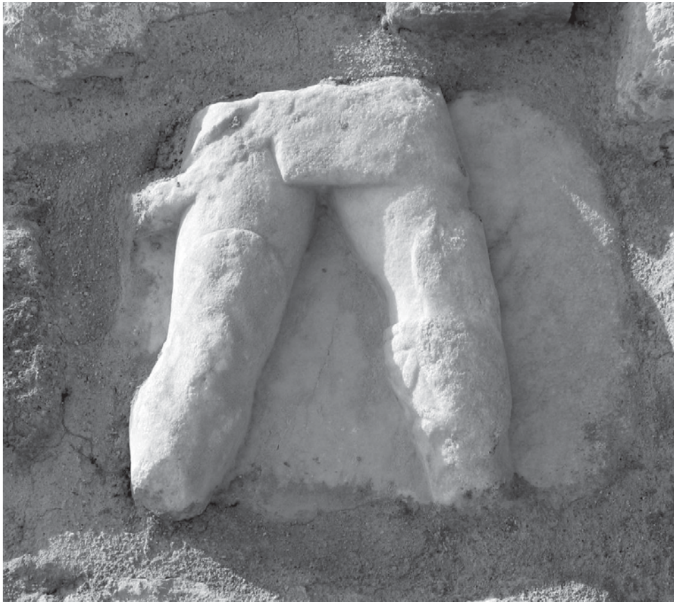
Fig. 4. The gladiatorial relief in the Axe Tower (Photograph: B. Poulsen).