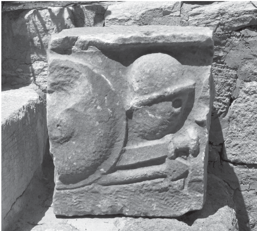
Fig. 5. The gladiatorial relief from Kislalik in Bodrum.