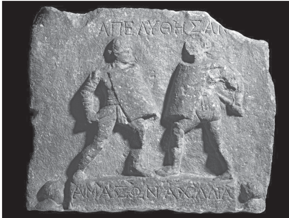
Fig. 2. The female gladiators Amazon and Achilla (British Museum Inv. GR 1847,0424.19).

fragmentary inscription from Ostia attests that the local duumvir, Hostilianus, and his wife were the first to show female gladiators in the harbour city of Rome, in the middle of the 2nd century AD, although the expression mulieres ad ferrum dedit can indicate both female gladiators and the execution in the arena of women condemned to death. 14 The appearance of all female single combat in the arena was prohibited by Septimius Severus, but Tiberius had already banned the appearance of freeborn women under the age of twenty in the arena, as is clear from the senatus consultum of AD 19, which is known from a copy found at Larinum in central Italy. 15