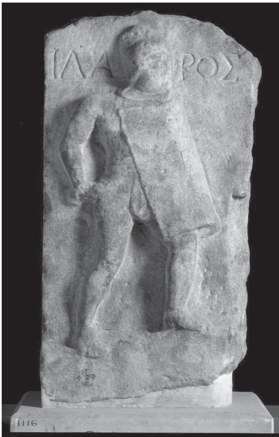
Fig. 1. The secutor Hilaros (British Museum).

Female performers as gladiators and animal-hunters in Rome appear in the literary sources during the reign of Nero and the Flavian Emperors, Titus and Domitian, but they seem to have been rare and exotic. 13 A